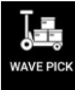
Wave Pick Icon

When ready to pick you can now load the wave pick onto the handheld from the wave pick option.